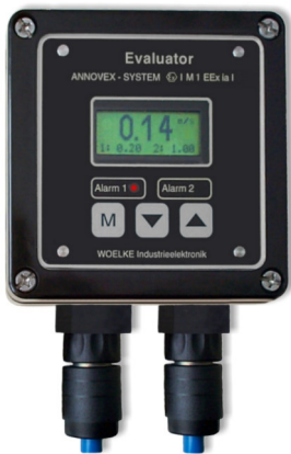
Evaluator Type GMA 30.00.5xx